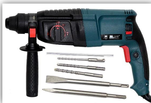
Jack Hammer Drilling Machine