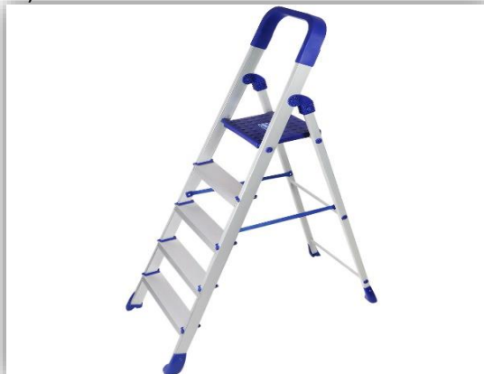
Step Ladder -(4ft)