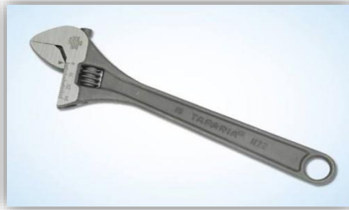
Adjustable slide wrench