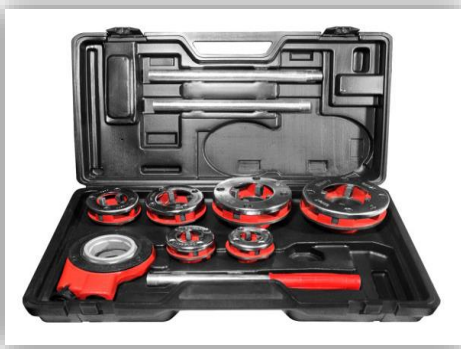
Ratchet Dies stock