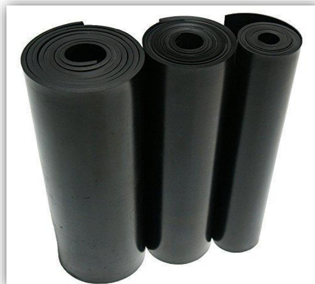
Rubber Gasket for Flange