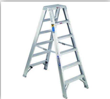
Step Ladder (7ft)