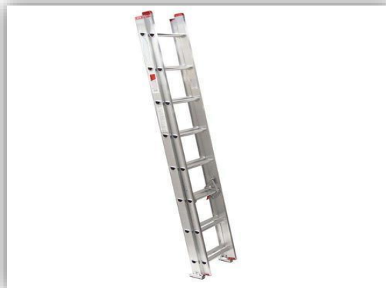
Extension Ladder (10 ft)